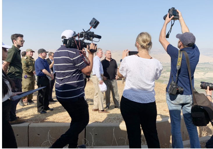
Bibi took me on a tour of the strategic geography of the Jordan Valley, June 23, 2019; here we overlook the valley from a secure Israeli position on the heights of the West Bank.